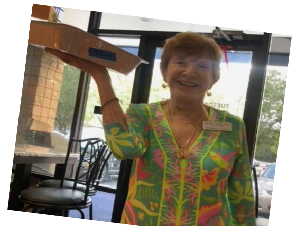
Have another Empanada!!