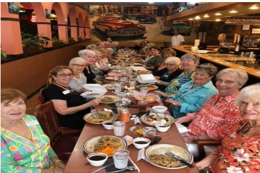
We were all so happy to see each other in person!