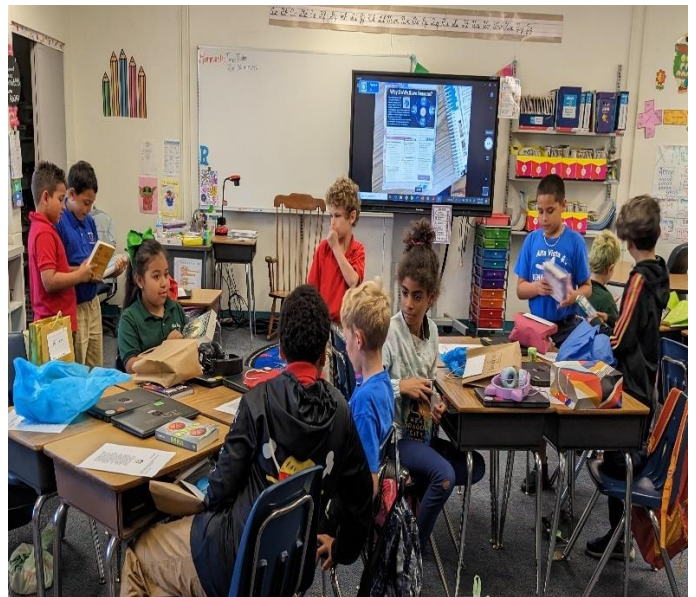
Submitted by Sue McGowan, Write-Read-Write