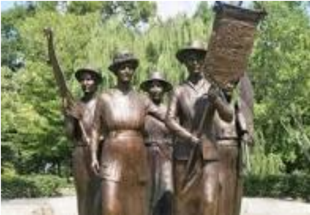
Nashville Suffragettes Statue

The mission of AAUW is to advance gender equity for women and girls through research, education, and advocacy..